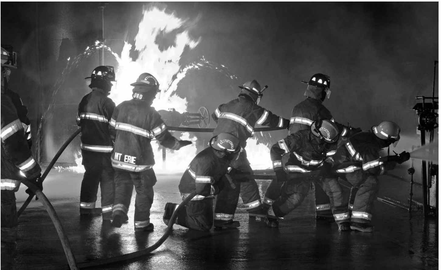
Mt. Erie volunteers practice controlling fuel spill fires at the Tesoro Refinery's practice fire facility.